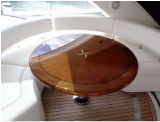
Additional Cockpit seating