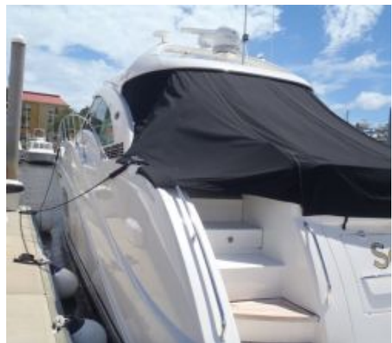
Port Aft side