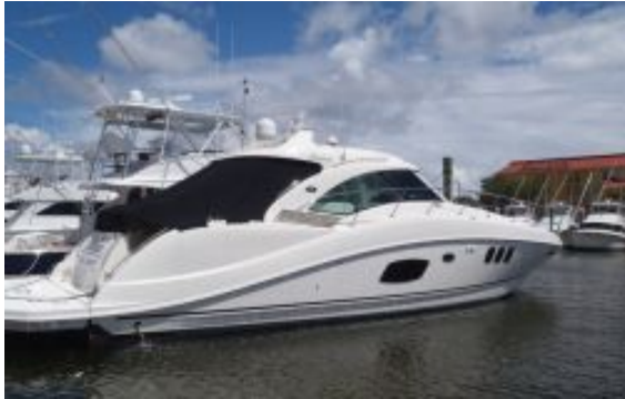
55' 2008 Sea Ray Sundancer