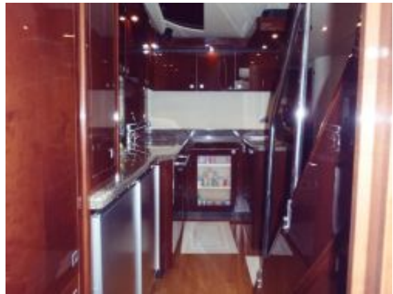
Entrance to galley