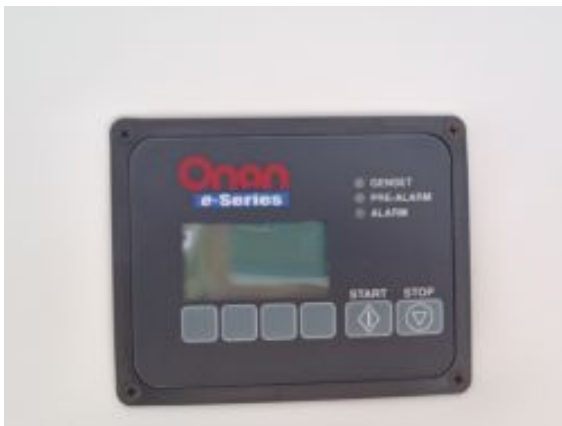
Onan Genset controls