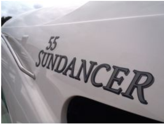
55 Hardtop with Sunroof