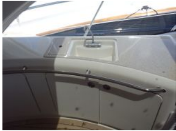
Cockpit Entertainment Area