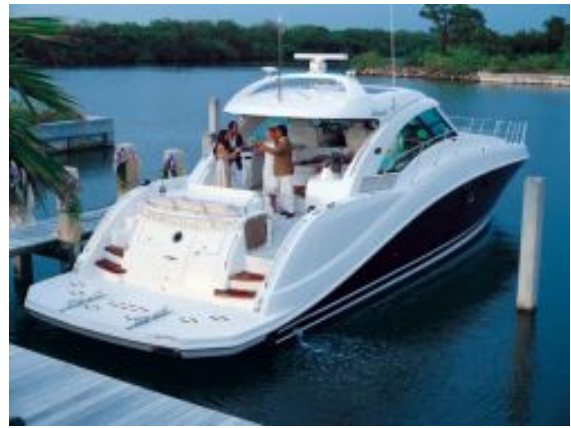
Aft starboard side