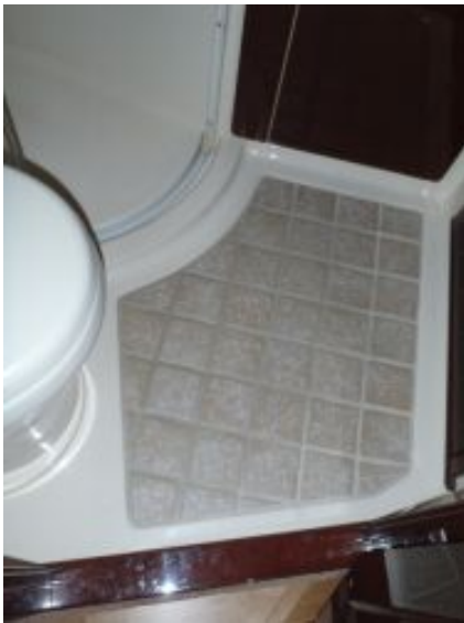
Head tile flooring