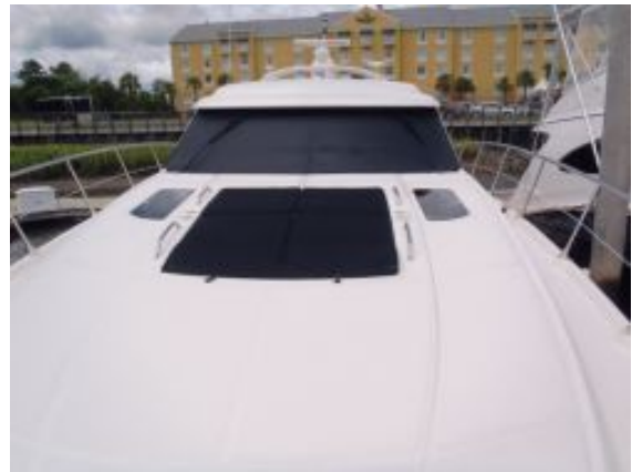
Bow with Sunpads