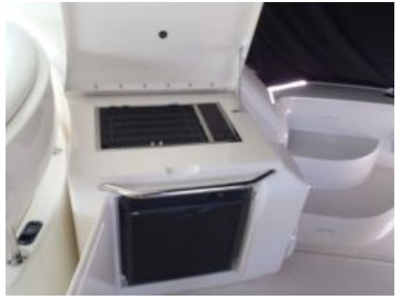
Wet bar and grill