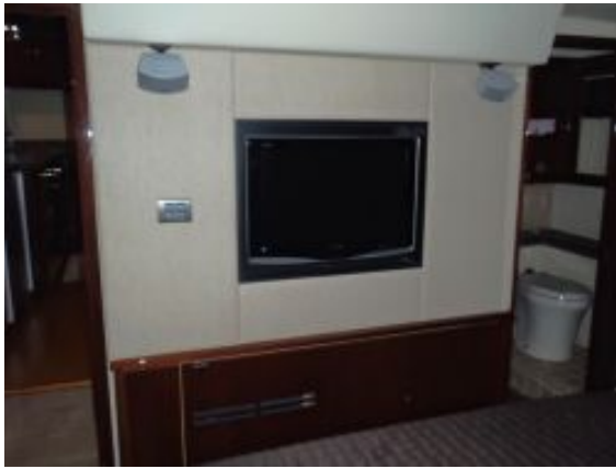
Master stateroom entertainment