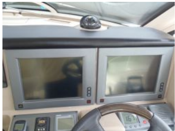
Sea Ray Navigator