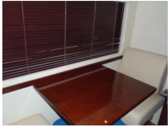
Master stateroom dinette