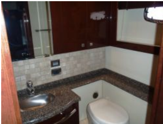
Master stateroom head