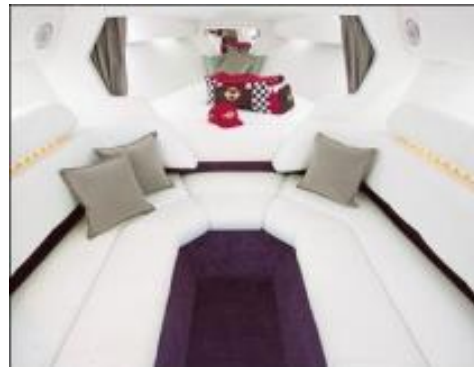
> Manufacturer Provided Image